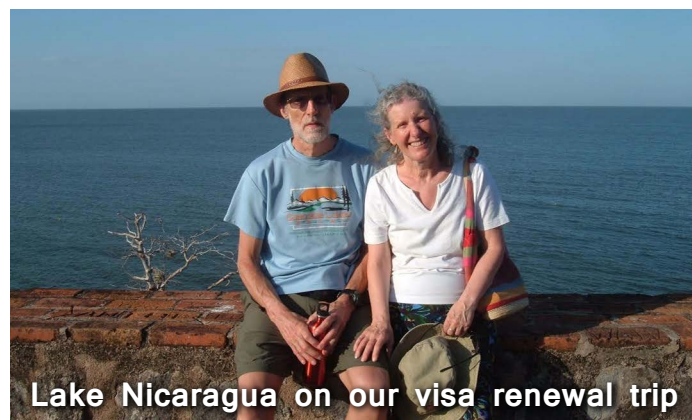
Lake Nicaragua on our visa renewal trip