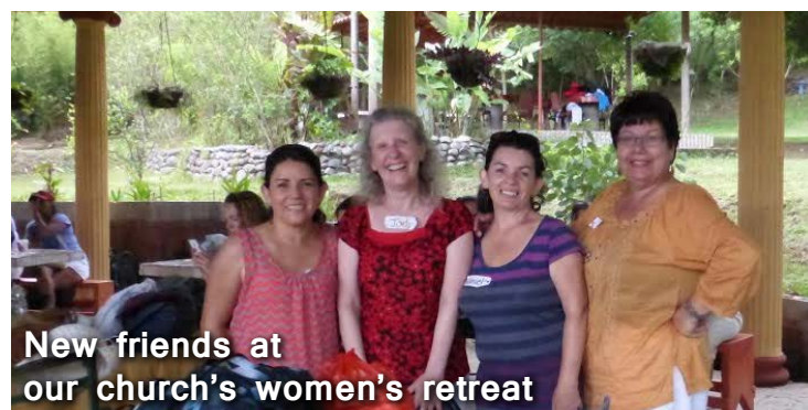
New friends at our church's women's retreat