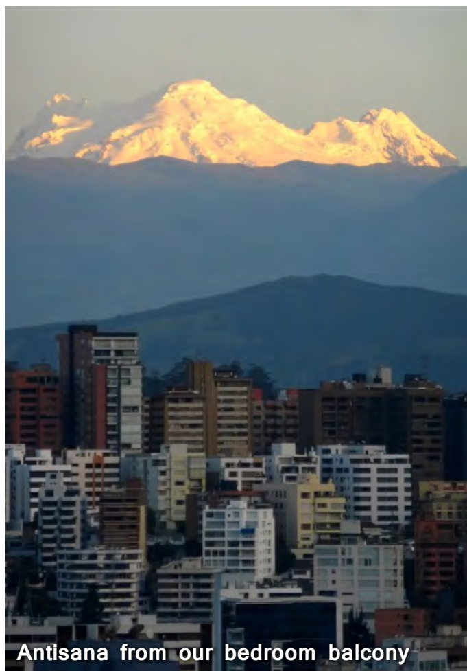
Antisana from our bedroom balcony

They come from Northern Ireland, Wales, England, Holland, Germany, Switzerland, Australia, New Zealand, Canada, USA, Cuba, Peru, Ecuador, and Argentina.