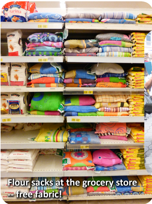
Flour sacks at the grocery store -- free fabric!