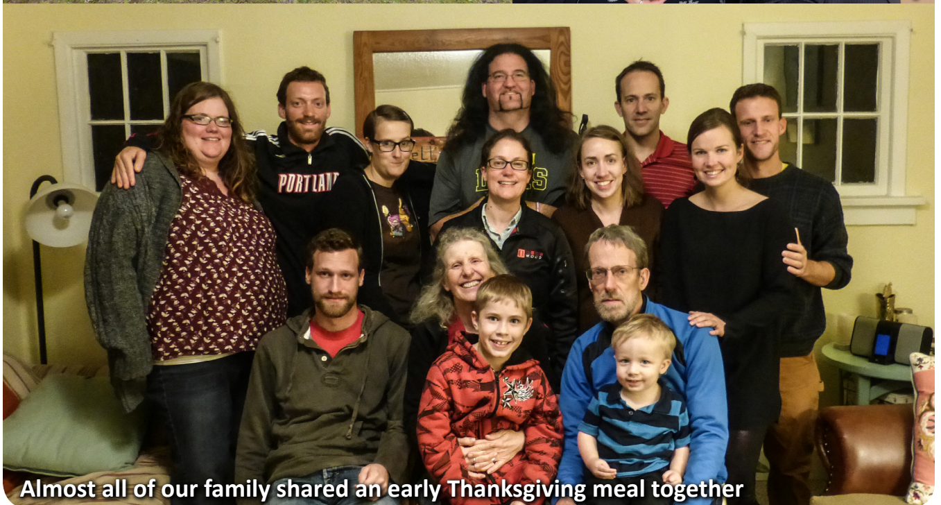
Almost all of our family shared an early Thanksgiving meal together